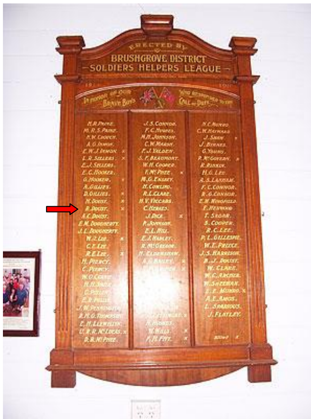
Brushgrove District Soldiers Helpers League Memorial